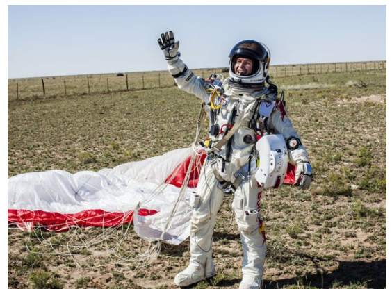
Red Bull Stratos Content Pool Photograph