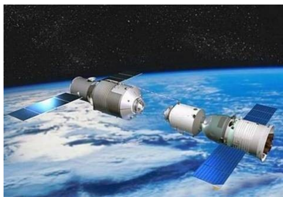
Tiangong-1 and Shenzhou 9