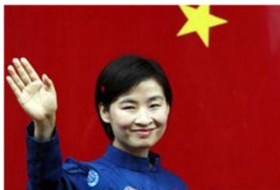
Air force pilot Liu Yang, China's first female taikonaut

http://articles.timesofindia.indiatimes.com/2012-10-28/china/34779930_1_shenzhou-10-space-lab-module-shenzhou-9