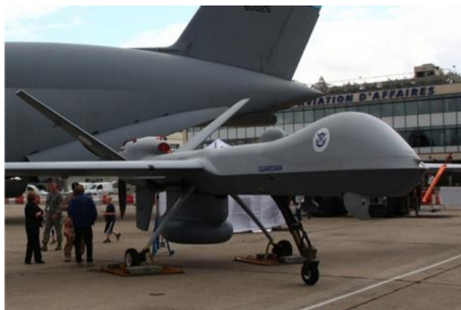
GA-ASI's Guardian RPA, a Predator B unmanned aerial vehicle configured for maritime operations.

craft (RPA), tactical reconnaissance radars, and electro-optic surveillance systems. For details, go to: http://www.avionics-intelligence.com/articles/2012/10/ga-asi.html